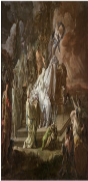
The Sacrifice of Iphigenia - Corrado Giaquinto (1759-1761)- Museo Nacional del Prado.

Here, the fundamental difference between Greeks and Romans becomes evident.