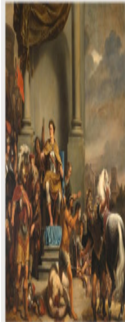
Censur Titus Manlius Torquatus Orders the Beheading of his Son (Ferdinand Bol, 1661 - 1663)

Tragedy taught the Greeks what should be avoided, while the Roman arena taught them how resilient they must be to pain and the spectacle of human life being extinguished.