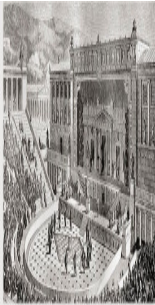
The Theatre Of Dionysus, Athens, Greece Drawing by Vintage Design Pics - Fine Art America

The former regarded Attic Tragedy as the highest form of education and culture - a space for reflection where deep moral dilemmas and the consequences of human choices were examined.