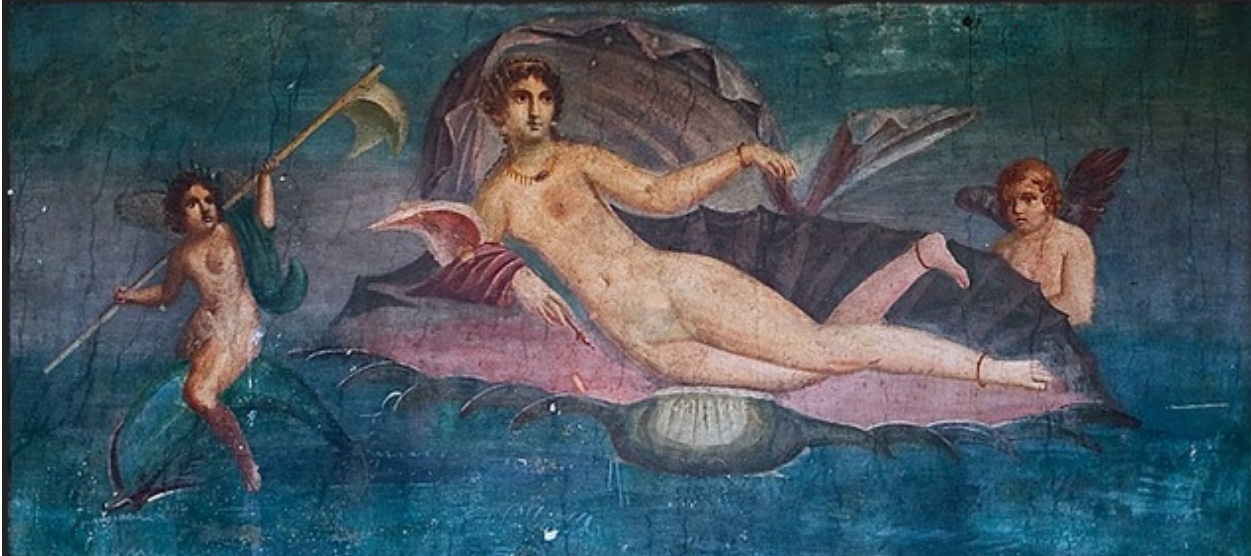
Wallpainting in Pompeii ('House of Venus'), supposedly based on Apelles.

Post by “Joshua” of September 8, 2024 at 11:50 AM