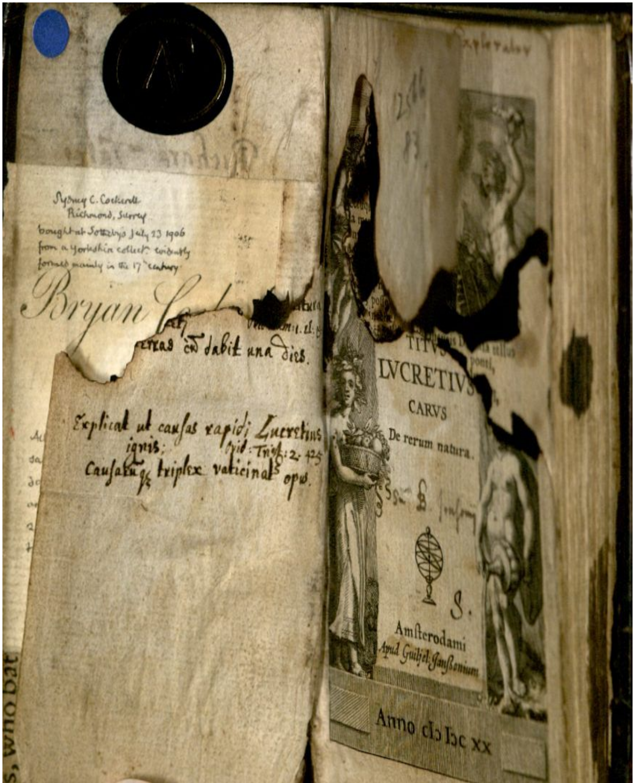
Photo: English Poet Ben Jonson's Copy of Lucretius with Acid Stain