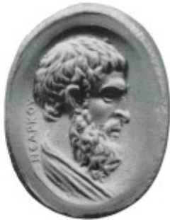
a, b (British Museum)