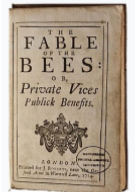
The title page of the 1714 edition of Mandeville's Fable of the Bees