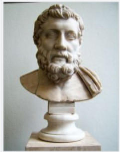
Roman copy of a Greek portrait bust of Metrodorus. (Pergamon museum, Berlin) 57