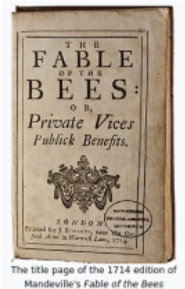
The title page of the 1714 edition of Mandeville's Fable of the Bees

Post by "Cassius" of August 26, 2021 at 11:02 AM